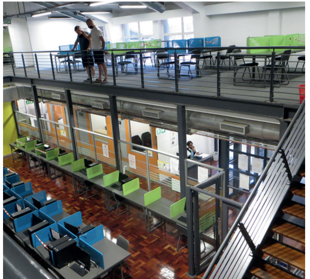
Pictured: some of the pictures taken during the site visits

The team will be developing three videos that will focus on the Research/Postgraduate Library Services, as well as services available at the Durban and Midlands libraries. Together with the supplier, the team visited all the sites as part of the project planning activities.