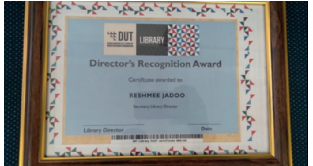
Above: Template used for Award Certificates

This category recognised staff members who retired in 2020 and early 2021.