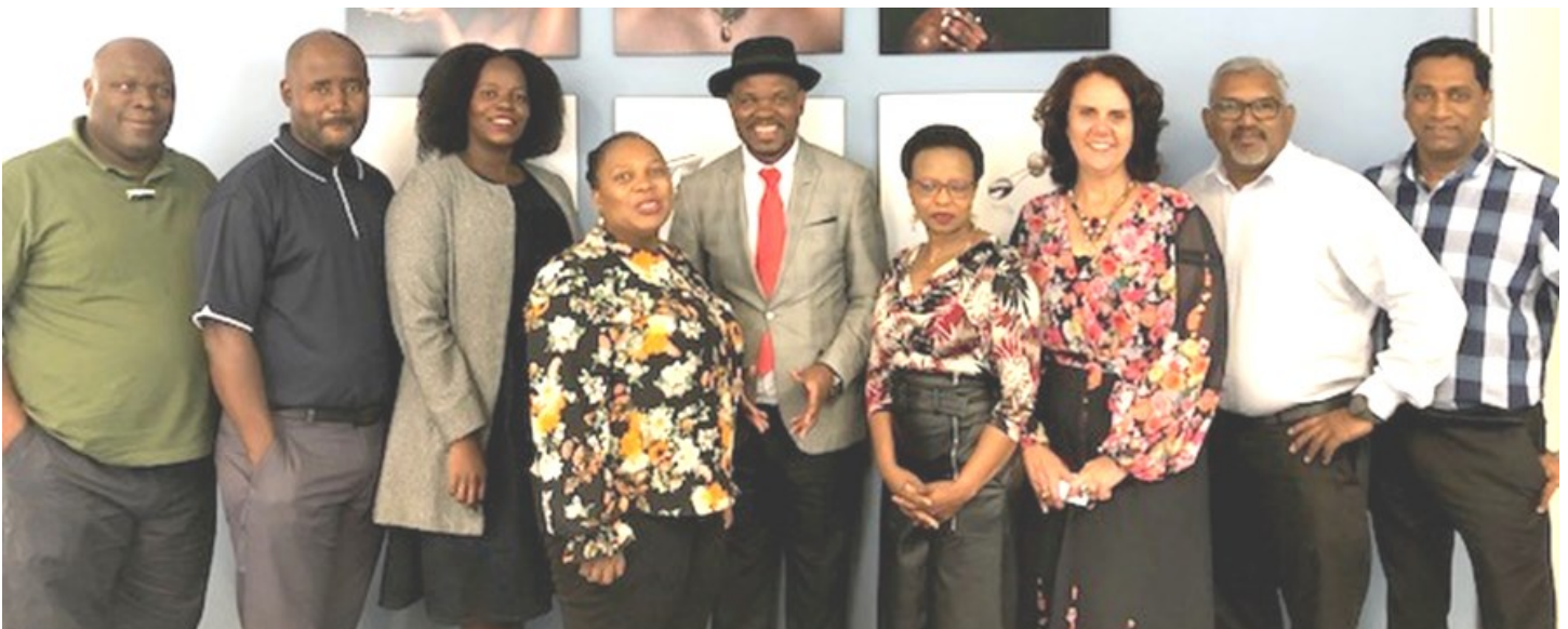
Bottom: University of Johannesburg Library Management with DUT Library Management