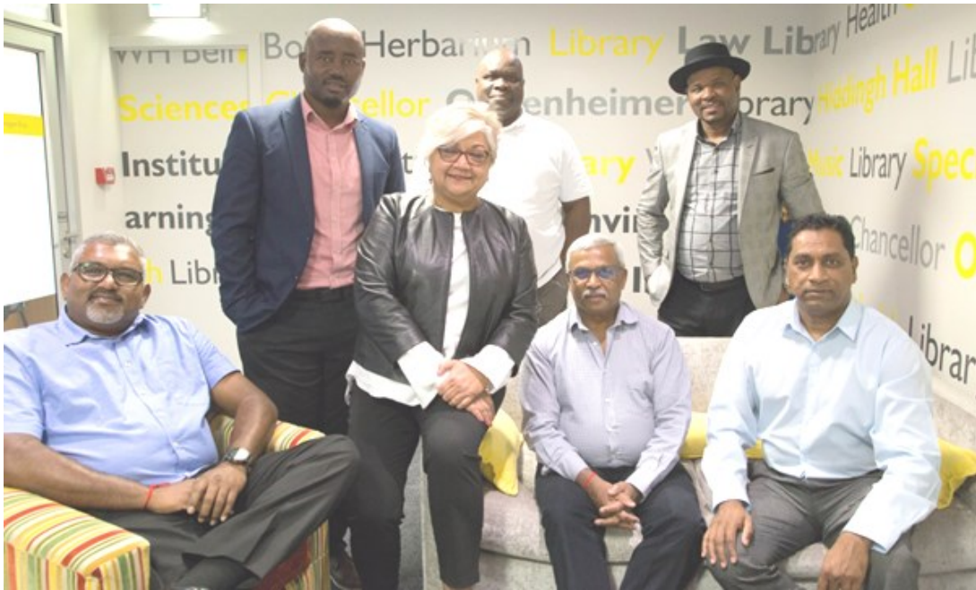
Top: DUT Library Management with some of the Executive Library Management at the University of Cape Town

A s part of the benchmarking process, Library Management visited the libraries at the University of Johannesburg, Stellenbosch University, and the University of Cape Town. The purpose of the visit was to interact and share ideas on topics like 4IR technologies, Open Science, Digitization, RDM projects, marketing, and many others.